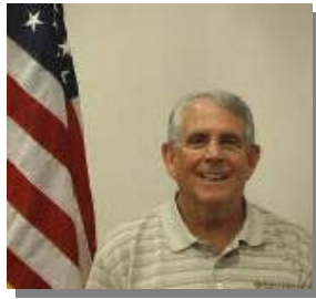
Mayor Bill Greene

5504 Stonebridge Road Pleasant Garden, NC 27313